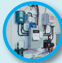
Online Instrumentation Readings

On-demand reports are efficiently and securely transferred to the Ministry of the Environment (MOE). With the