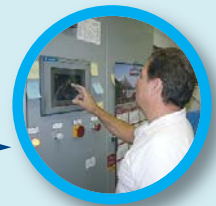
OCWA Operator and Management