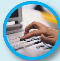
Data Entry of Readings and Samples